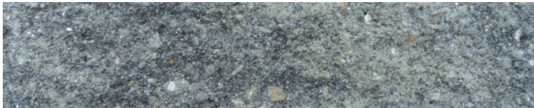
Granite Hill Blend