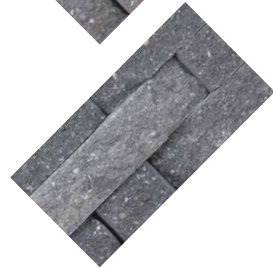
Granite Hill Blend